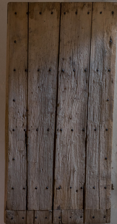
Plaza Blanca, 2025, Palau de Casavells, Casavells.