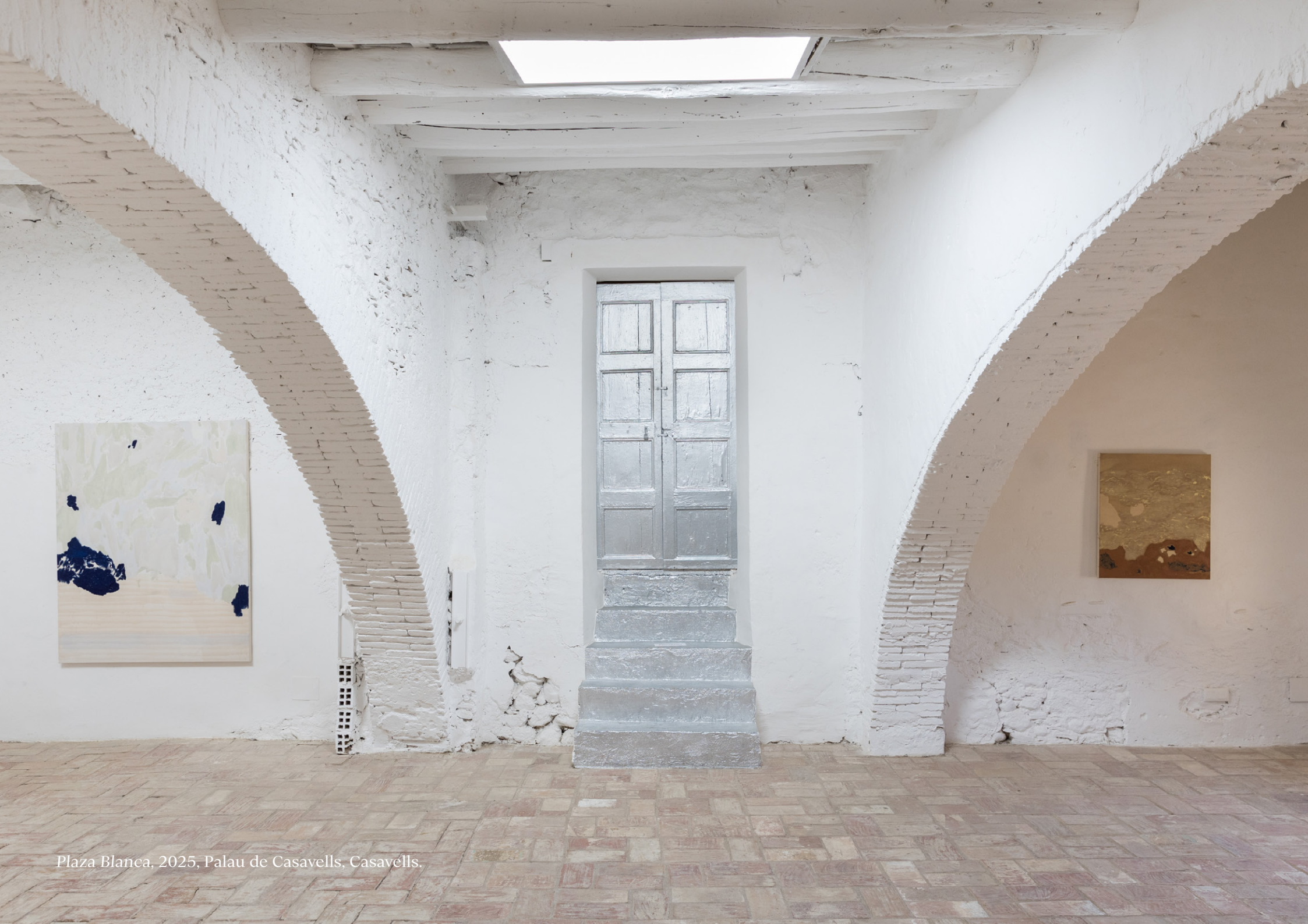
Plaza Blanca, 2025, Palau de Casavells, Casavells.