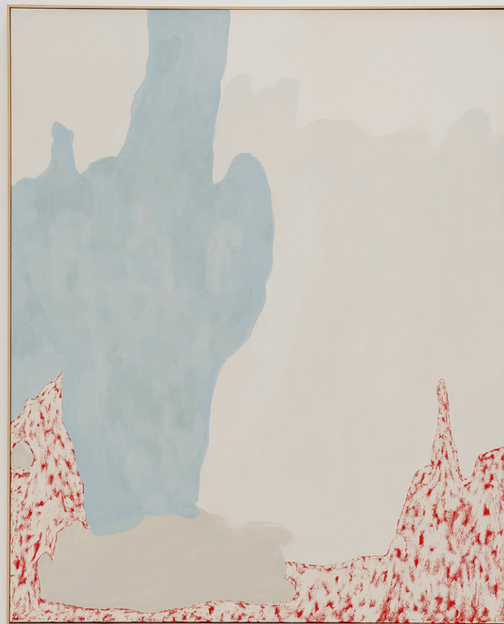
ARC01/24, 2024 Oil and acrylic on canvas 160 × 130 cm Entre casa María y la mía, 2024, Alzqueta Gallery, Madrid.