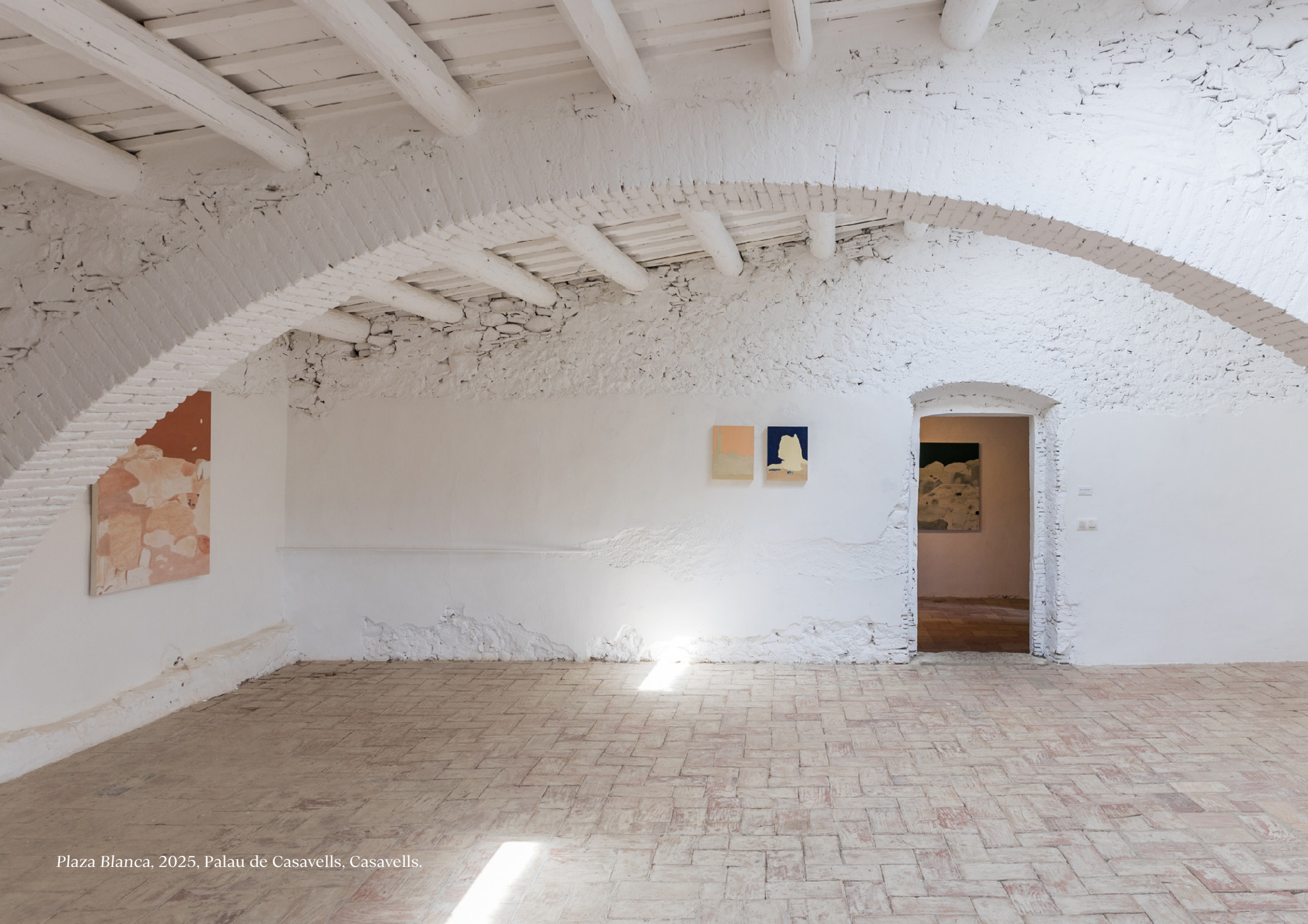
Plaza Blanca, 2025, Palau de Casavells, Casavells.