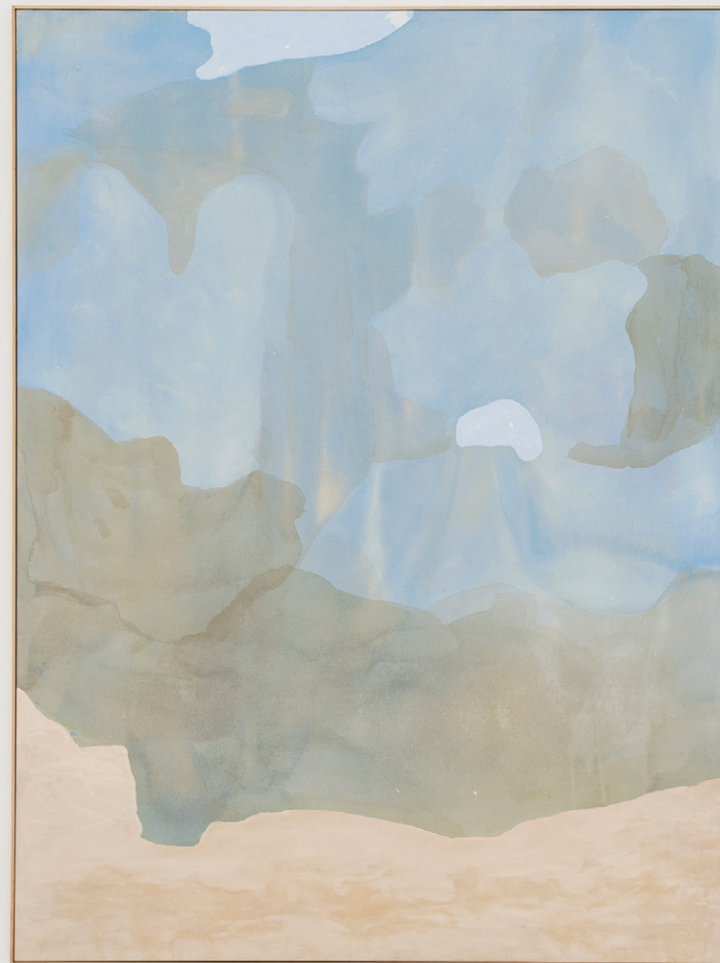
A12/23, 2023 Oil and acrylic on canvas 200 × 150 cm Entre casa María y la mía, 2024, Alzueta Gallery, Madrid.