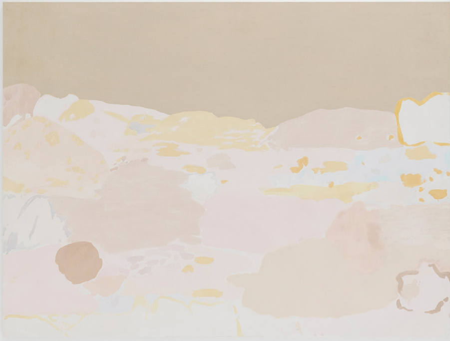
Weiner Rd, 2025 Oil and acrylic on canvas 200 × 150 cm Plaza Blanca, 2025, Palau de Casavells, Casavells.