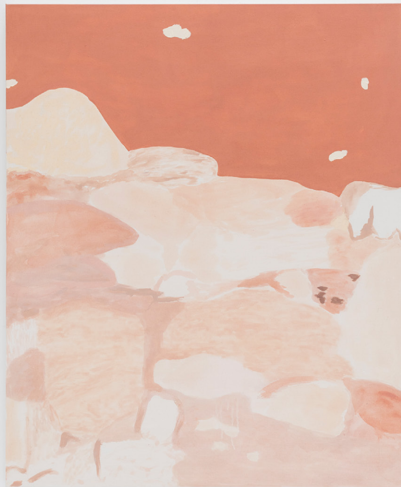
Mesa Montosa, 2025 Oil and acrylic on canvas 115 × 95 cm Plaza Blanca, 2025, Palau de Casavells, Casavells.