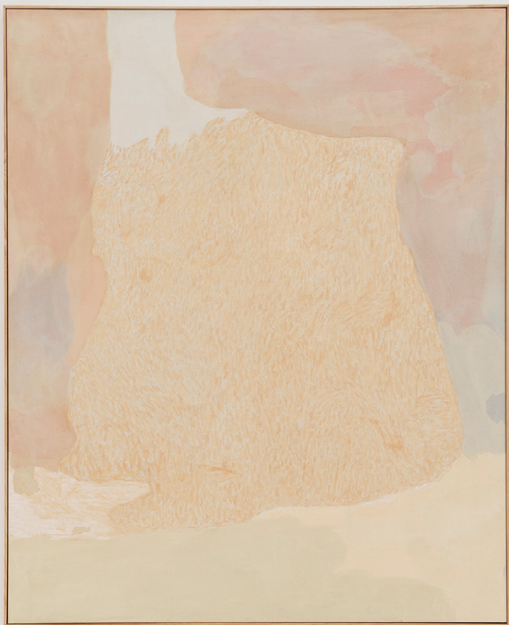
N01/24, 2024 Oil, pastel and acrylic on canvas 160 × 130 cm Entre casa María y la mía, 2024, Alzueta Gallery, Madrid.