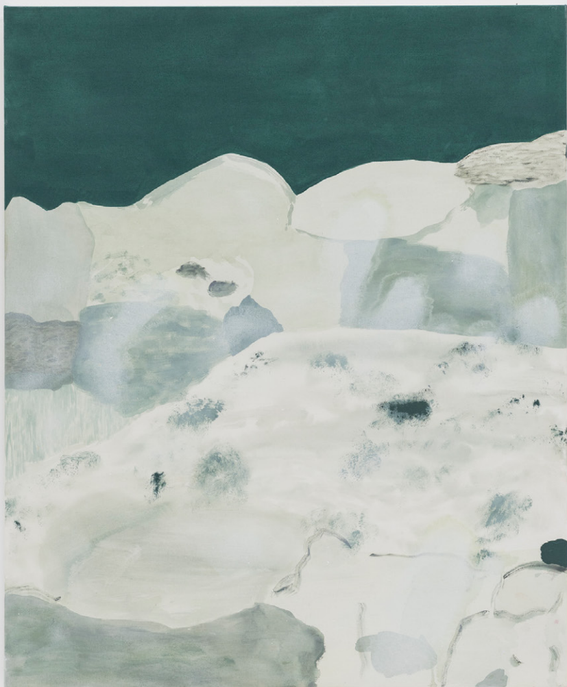
Witt Rd, 2025 Oil and acrylic on canvas 115 × 95 cm Plaza Blanca, 2025, Palau de Casavells, Casavells.