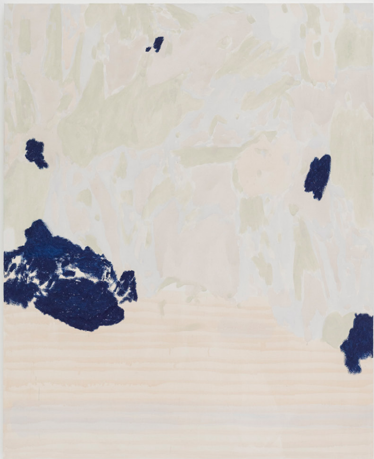
Donde la serpiente , 2025 Oil and acrylic on canvas 160 × 130 cm Plaza Blanca , 2025, Palau de Casavells, Casavells.