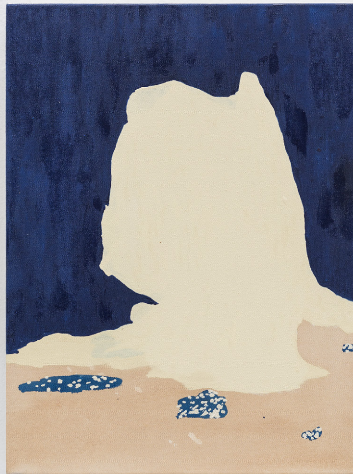
Salvia, 2025 Oil and acrylic on canvas 40 × 30 cm Plaza Blanca, 2025, Palau de Casavells, Casavells.