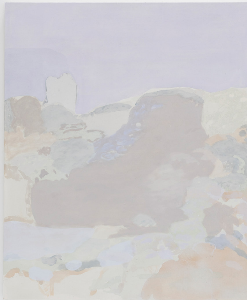
Ledoux St, 2025 Oil and acrylic on canvas 115 × 95 cm Plaza Blanca, 2025, Palau de Casavells, Casavells.