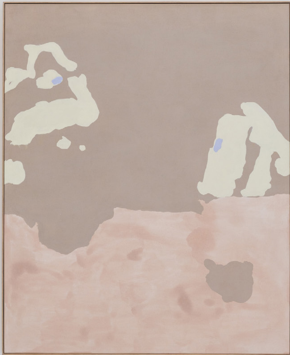
MBL09/24, 2024 Oil and acrylic on canvas 160 × 130 cm