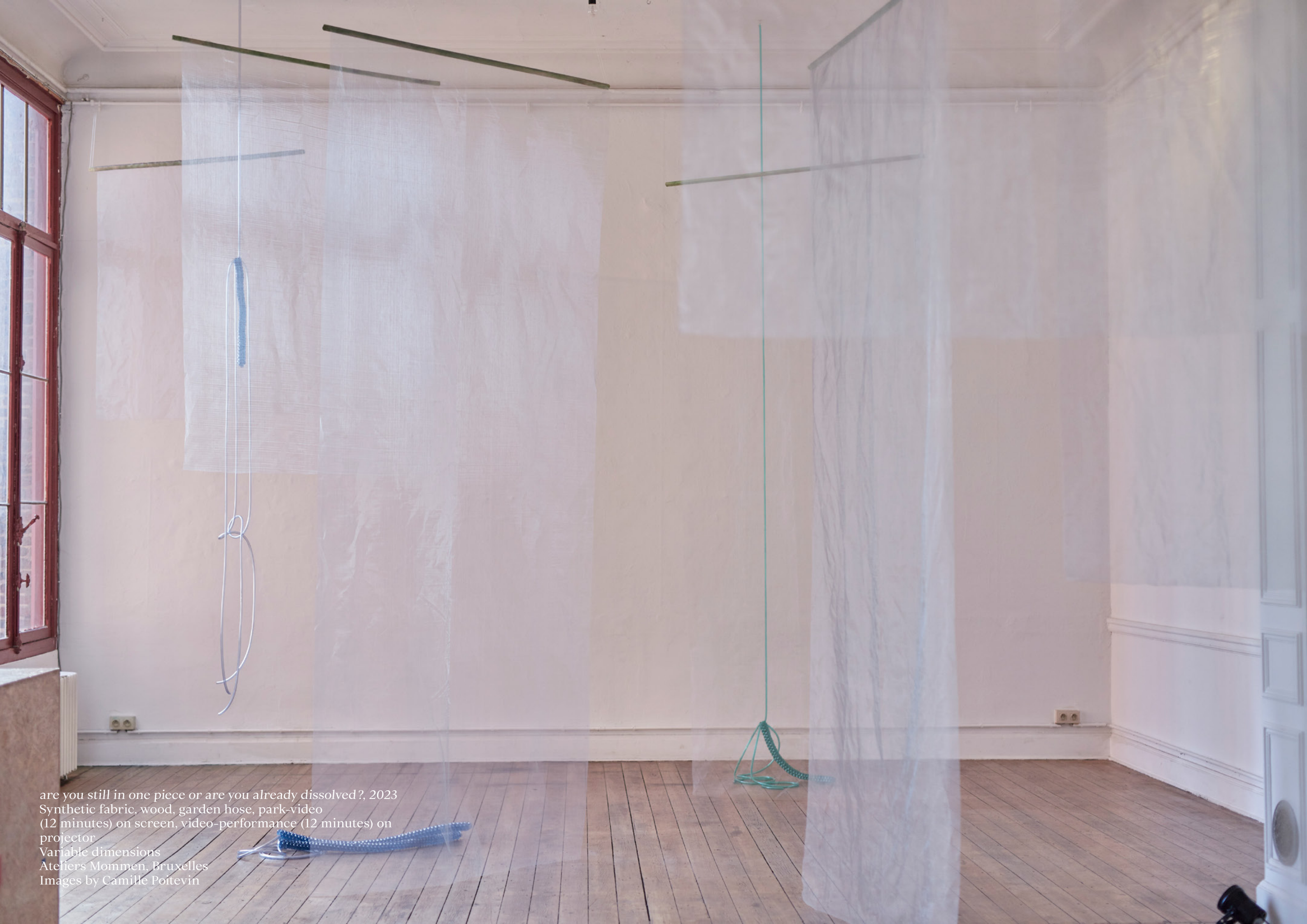
are you still in one piece or are you already dissolved? , 2023 Synthetic fabric, wood, garden hose, park-video (12 minutes) on screen, video-performance (12 minutes) on projector Variable dimensions Ateliers Mommen, Bruxelles