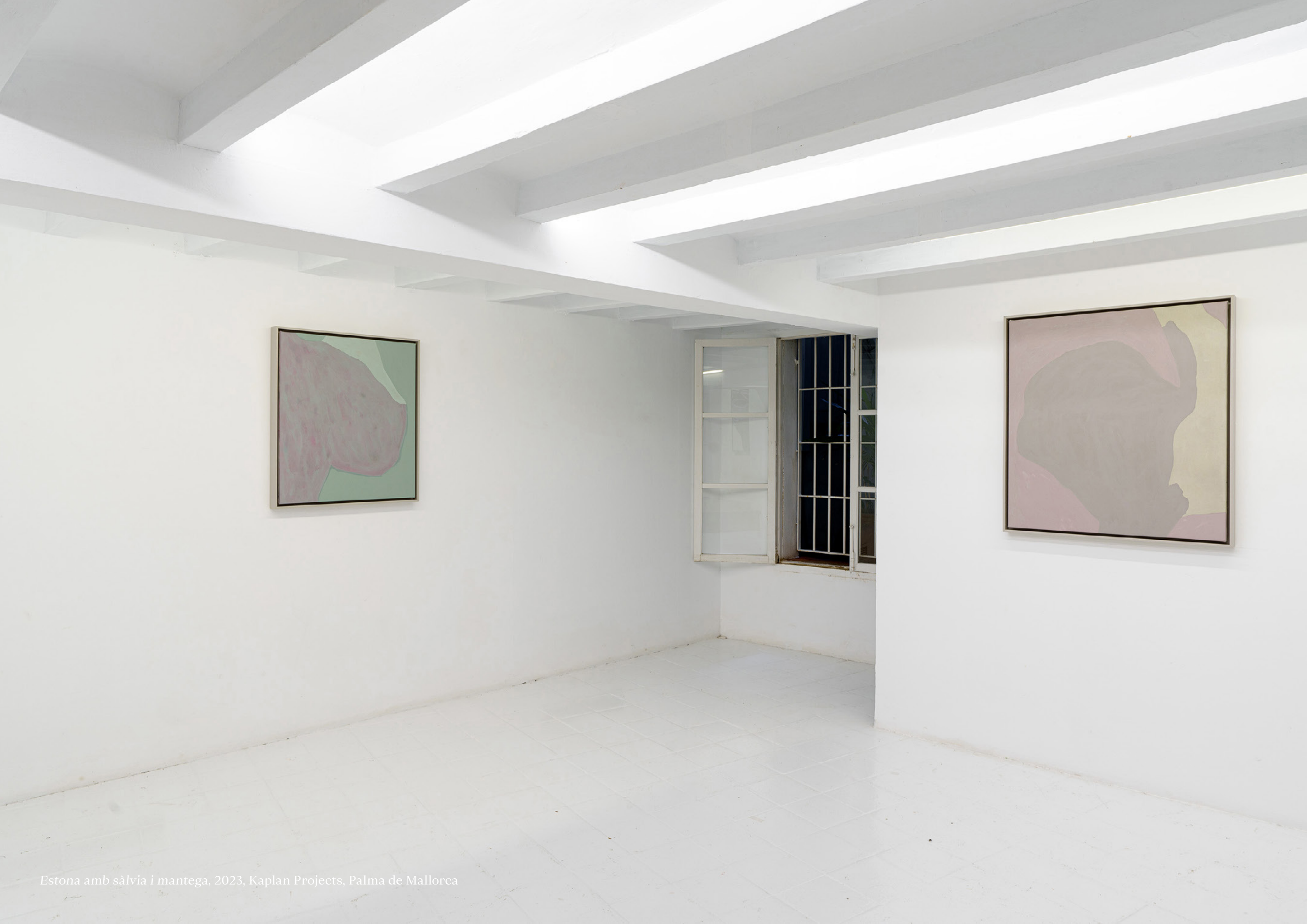
Estona amb sàlvia i mantega, 2023, Kaplan Projects, Palma de Mallorca