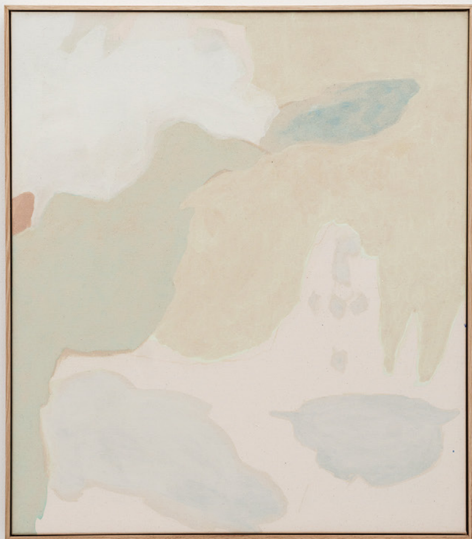
CR12/23, 2023 Oil and acrylic on canvas 80 × 70 cm Entre casa María y la mía, 2024, Alzqueta Gallery, Madrid.