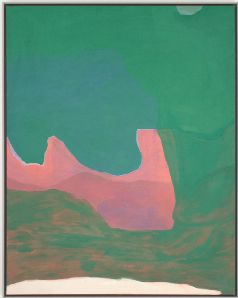
CR06/23, 2023 Série Raixa Acrylic on canvas 140×110cm

Estonia amb sàlvia i mantega, 2023, Kaplan Projects, Palma de Mallorca