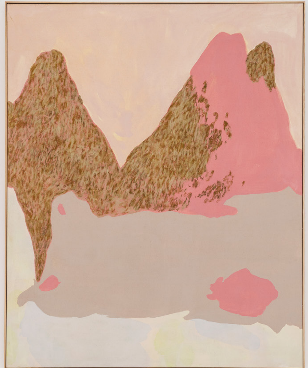
TVM01/24, 2024 Acrylic and pastel on canvas 160 × 130 cm Entre casa María y la mía, 2024, Alzueta Gallery, Madrid.