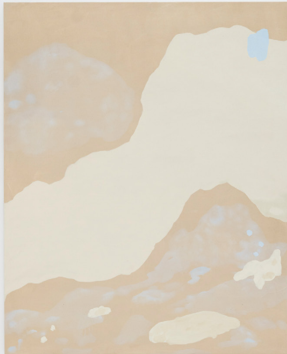
AAB09/24, 2024 Oil and acrylic on canvas 160 × 130 cm