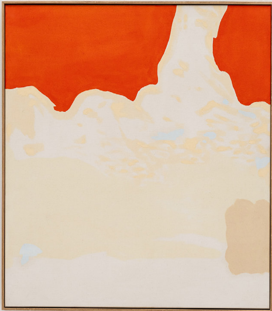
NB05/24, 2024 Oil and acrylic on canvas 80 × 70 cm