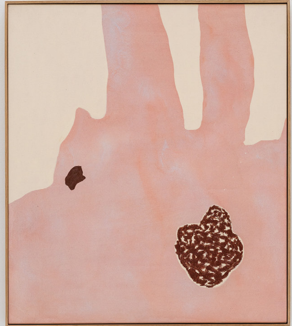
R09/24, 2024 Oil and acrylic on canvas 80 × 70 cm