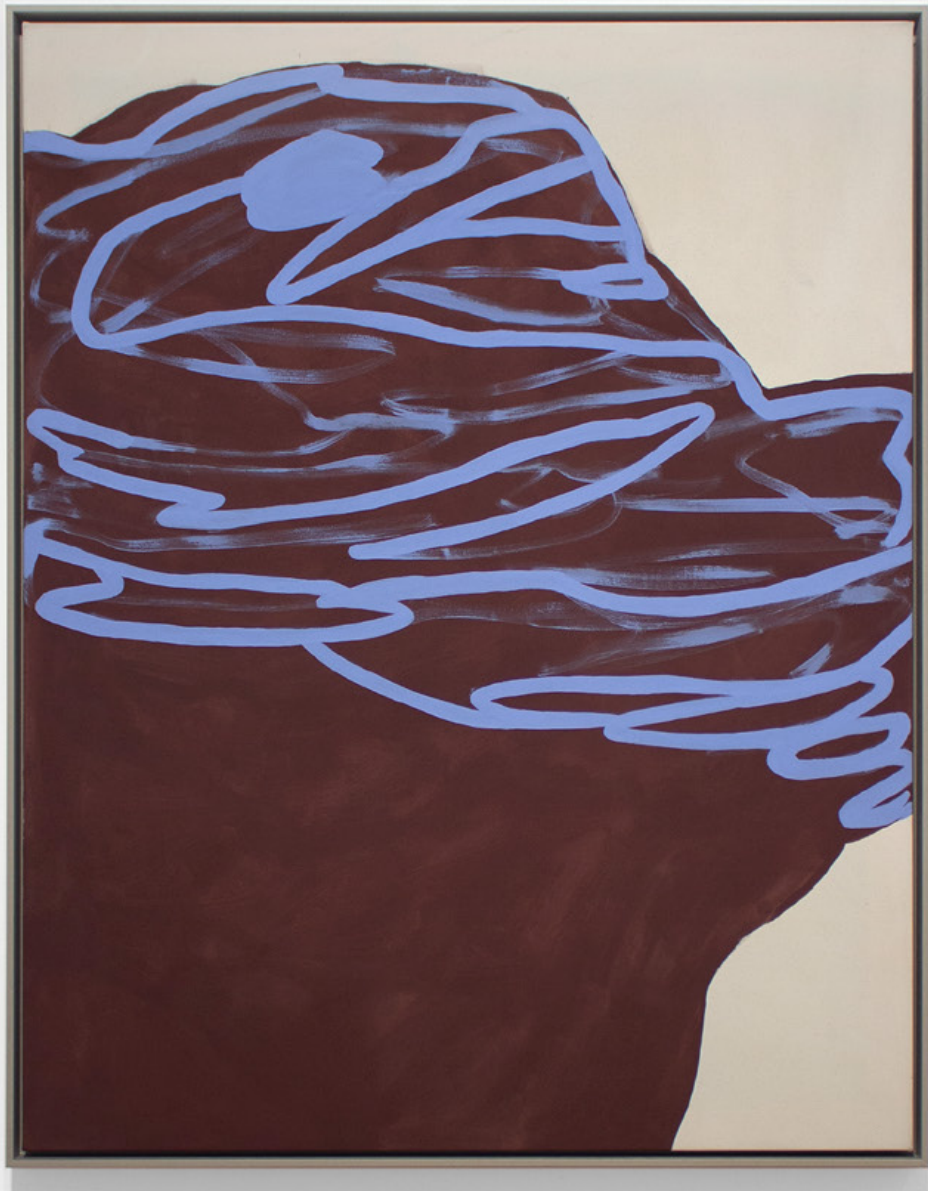
SA06/23, 2023 Série Raixa Acrylic on canvas 140×110cm

Estonia amb sàlvia i mantega, 2023, Kaplan Projects, Palma de Mallorca