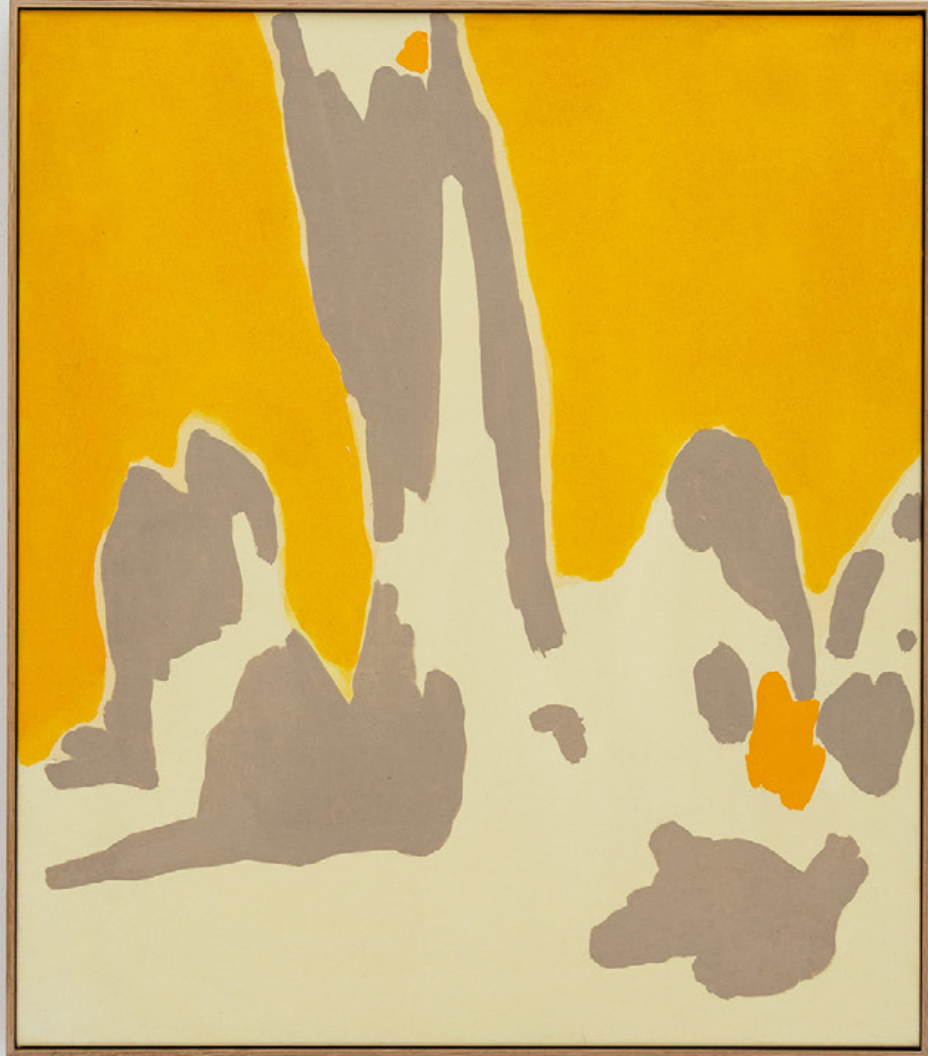
NA09/24, 2024 Oil and acrylic on canvas 80 × 70 cm