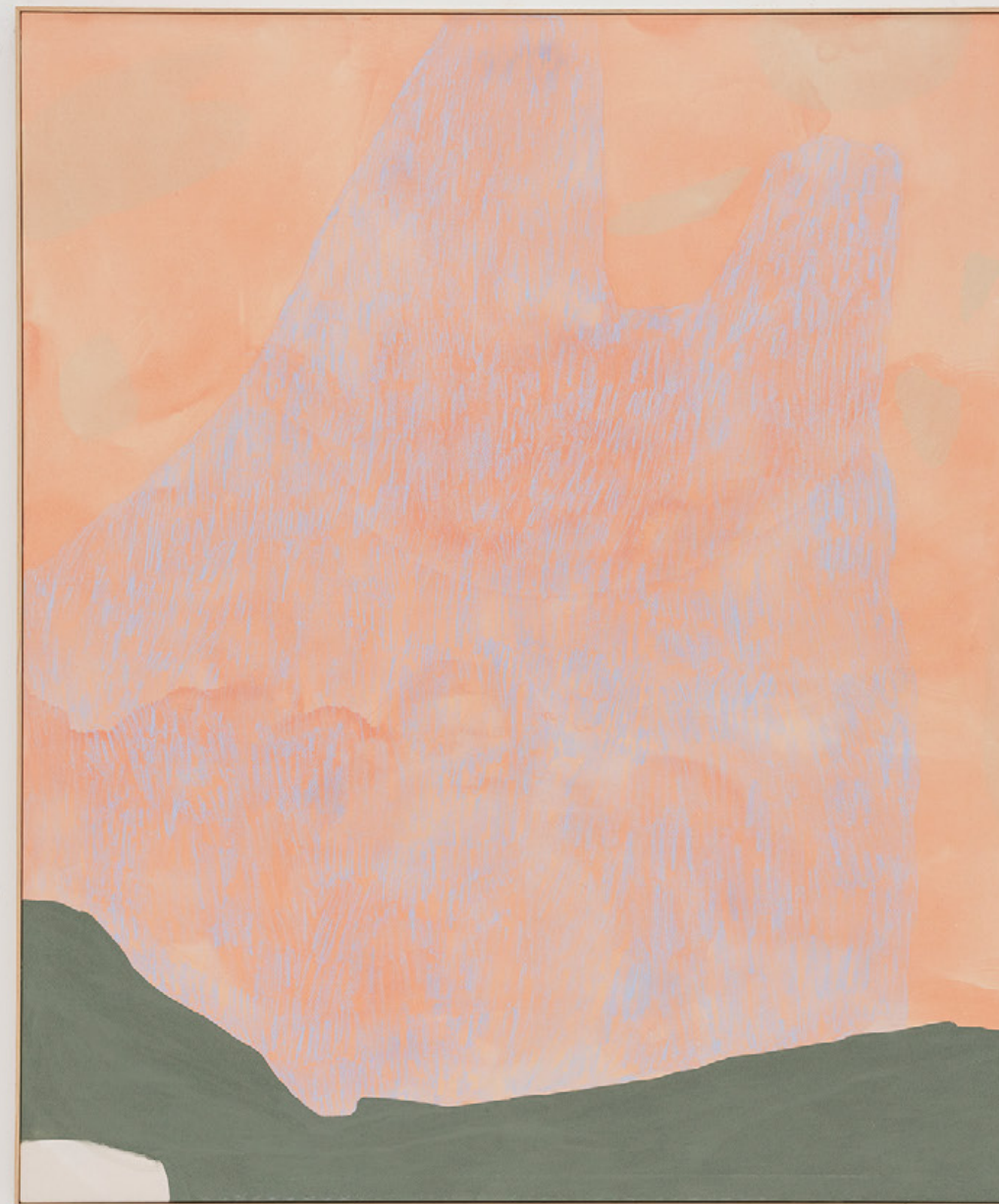
NAV11/23, 2023 Acrylic and pastel on canvas 180 × 150 cm Entre casa María y la mía , 2024, Alzqueta Gallery, Madrid.